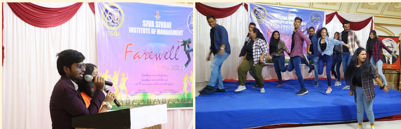
Memories from SMRITI – 2022, Cultural and Dance performance by our Junior Students