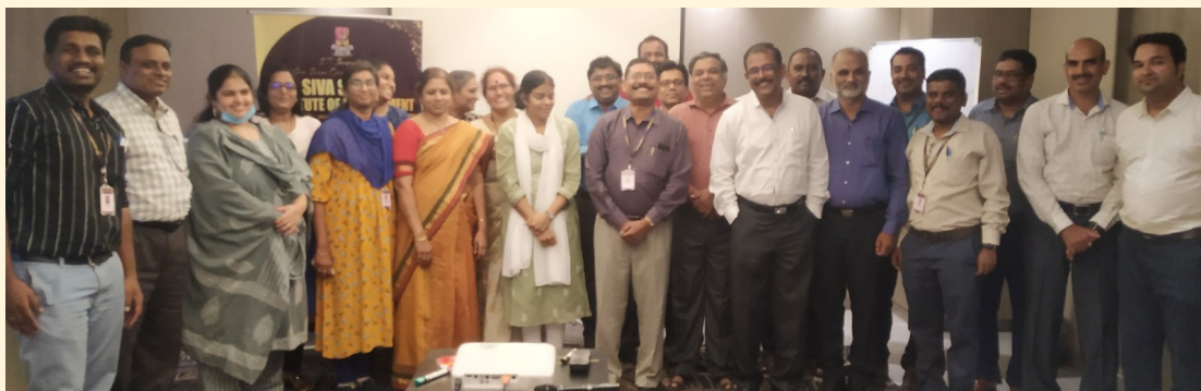
Memories of FDP