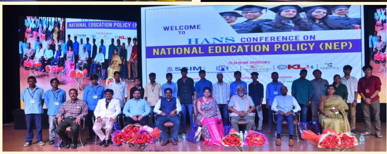
Glimpses of HANS 2022 Conference on- National Educational Policy