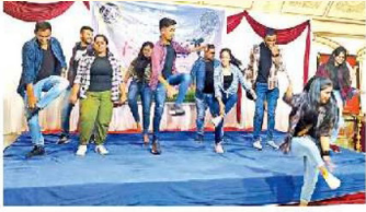
విద్యార్థుల శుభ్ర విన్యాసం